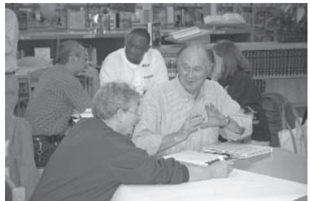
Members of th inaugural EXCEL class work on a team project.

Sponsor letters will go out in early August, but individual seating and tables are available now. Call NNI at 454-2000 for information.