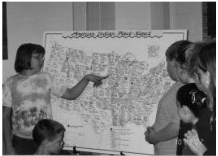
Eastgate Middle School students examining Michell's handcrafted map of Indian Place Names

Remember: Line Creek's Indian Festival. Watch for posters and news items.