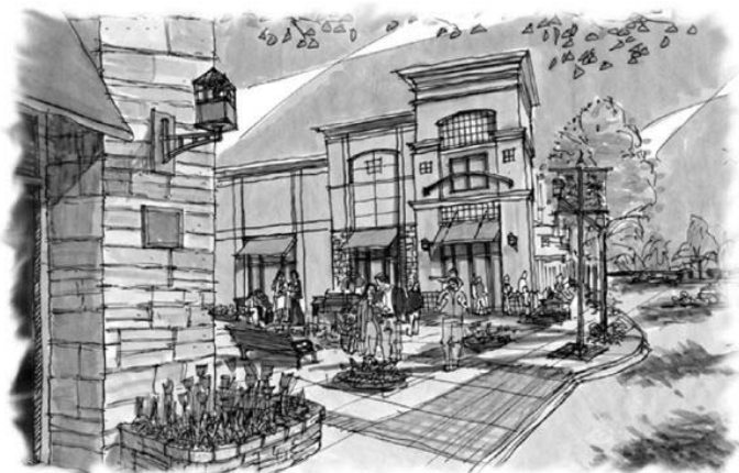
This architect's drawing gives a glimpse of the future Antioch Mall.