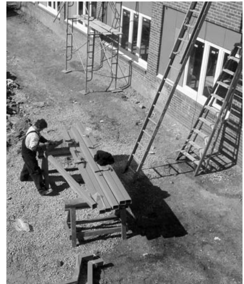
Construction is more than half completed on the new senior living village on the former Eastwood School site. Above, a workman fashions new guttering for the main apartment building.

Residents will enjoy a 2,300 square foot activity center (formerly the school gymnasium). It will feature regular educational and recreational programs, plus computers for e-mailing and Internet exploring, and regular social events.