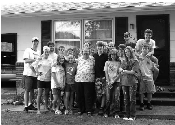
Everyone was happy at the end of this "Energize and Restore" project.