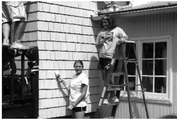
This house got energized by some high-energy young women from the Clay-Platte Baptist Association