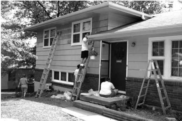
These young volunteers caulked windows, painted and repaired a front porch

NNI has participated in the program for 8 years and plans to continue again next year.