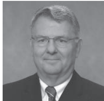
Dave Mecklenburg Outstanding Public Service Award