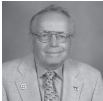
Charles Lamb McManus Good Neighbor Award