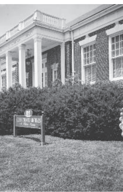
The Clay County Archives are housed at 210 East Franklin in Liberty, MO

Now that information is incorporated into a remarkable documentary called "The Story of Liberty from Settlement to Suburb." Really, this fine film is