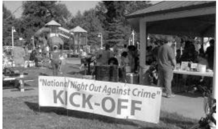
Neighbors gather for the 2005 Kick-Off at Penguin Park.