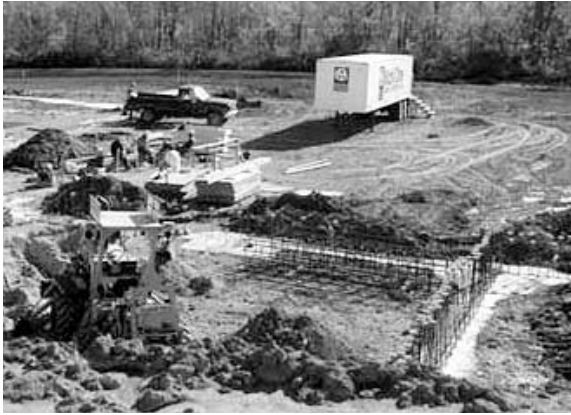
Work progresses at the Shoal Creek complex.