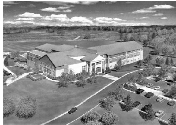
The new Police Academy will adjoin the Shoal Creek Station.

K ansas City, Missouri, north of the river, is changing rapidly as traditionally rural areas give way to new businesses and expanding residential communities. The coming months promise to be an exciting time for the Police Department and residents of the Northland, as the new Shoal Creek Patrol Division is established. Construction of the new police station on Pleasant Valley Road at the intersection of Shoal Creek Parkway is underway. In the interim, the staff members already assigned to the temporary facility at Antioch Mall are busy making preparations. This includes creating strong relationships with neighborhood and business associations to develop problem-solving strategies, as well as incorporate their ideas in our plans for the future. Additional police officers and civilians will be assigned in anticipation of opening the new building.