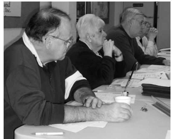
The NNI Board was one of 2005's top success stories.