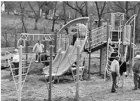
Installation day at Golden Oaks

Please stop by and see what great accomplishments can be made by a neighborhood and members of the community working together.