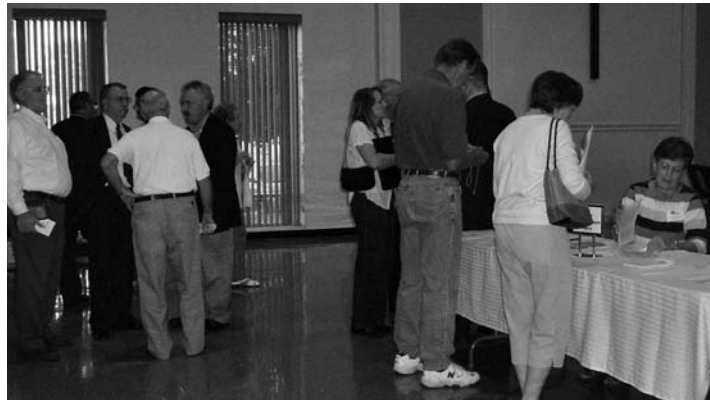
The member certification process conducted over the past year helped make the June 28 Annual Meeting a big success.

NNI currently lists 63 neighborhood associations as officially certified. These members will be contacted by NNI during the coming weeks and asked to complete a simple renewal form.